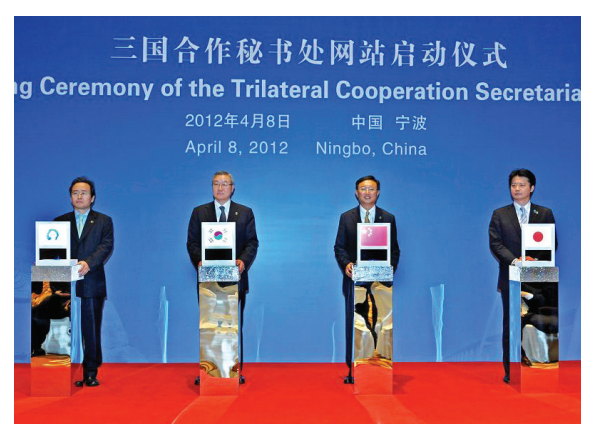
Side Event - Launching Ceremony of the TCS Website