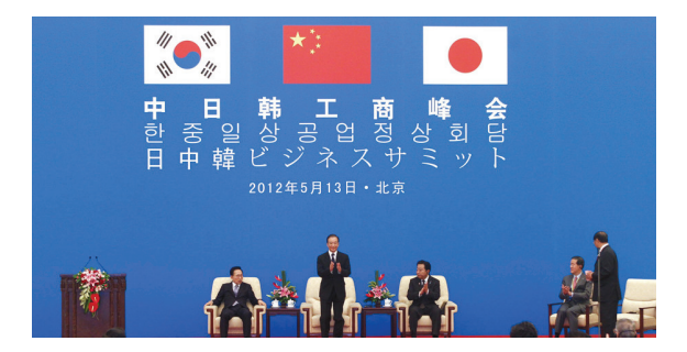
4th Trilateral Business Summit (Beijing, May 13, 2012)

back with the 5th Trilateral Summit in Beijing, May 2012. Joint Statement was issued at the end of the Business Summit, which called upon the three governments to launch the Trilateral FTA negotiations at an earliest time. The three groups also suggested that the three countries further promote financial cooperation as well as industrial cooperation in areas such as energy, environment conservation, logistics and intellectual property rights.