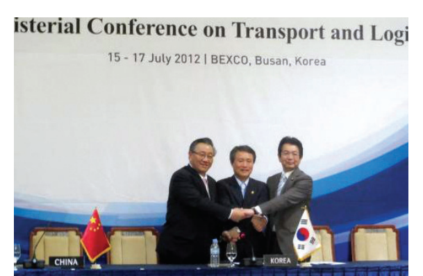
지수가 한국의 교통으로 Transport and Agricos The P Chandrage About Transport and Transport and Agricos (Find Transport About Transport and Transport and Agricos) (Find Transport About Transport About Transport About Transport About Transport About Transport About Transport About Transport About Transport About Transport About Transport About Transport About Transport About Transport About Transport About Transport About Transport About Transport About Transport About Transport About Transport About Transport About Transport About Transport About Transport About Transport About Transport About Transport About Transport About Transport About Transport About Transport About Transport About Transport About Transport About Transport About Transport About Transport About Transport About Transport About Transport About Transport About Transport About Transport About Transport About Transport About Transport About Transport About Transport About Transport About Transport About Transport About Transport About Transport About Transport About Transport About Transport About Transport About Transport About Transport About Transport About Transport About Transport About Transport About Transport About Transport About Transport About Transport About Transport About Transport About Transport About Transport About Transport About Transport About Transport About Transport About Transport About Transport About Transport About Transport About Transport About Transport About Transport About Transport About Transport About Transport About Transport About Transport About Transport About Transport About Transport About Transport About Transport About Transport About Transport About Transport About Transport About Transport About Transport About Transport About Transport About Transport About Transport About Transport About Transport About Transport About Transport About Transport About Transport About Transport About Transport About Transport About Transport About Transport About Transport About Transport About Transport About Transport About

The 13th Northeast Asia Port Director-General Meeting was held in Otaru, Japan in October 2012. They agreed to integrate the operations of the Consultative Council and the Working Groups. Each working Group was to select a port related subject for research and report the progress of the projects for discussion at the Consultative Council Meeting. The 7th Consultative Council Meeting was held one day before the Director-General Meeting, and decided to perform the following works: 1) "Promotion of Marina Network among Northeast Asia" by ROK; 2) "Promotion of RFID application in the Northeast Asian maritime container transport" by China; 3) "Promotion of Sea-Land Inter-Modal Transport in Northeast Asia" by Japan.